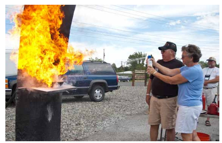
Mac's Fire Extingusher Demonstration'