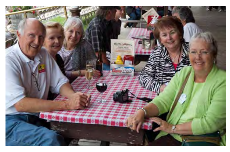
Social Hour on the Irma Hotel Deck