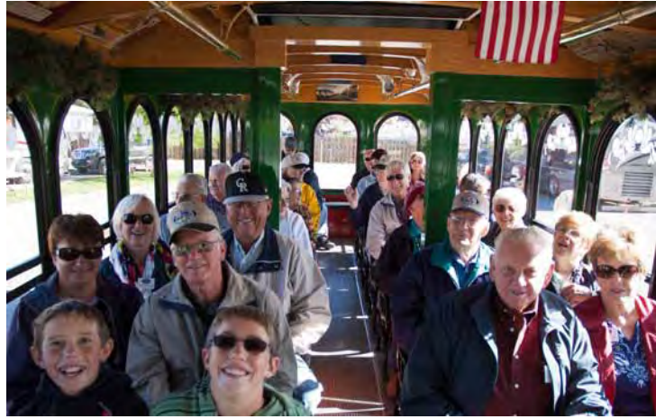
In one hour we were told 100 years of Cody's history.

We had breakfast at the Sunset House, which was a short walk from the Park on Wednesday morning. The wind wasn't as bad and by the time we went on the Trolley Tour of Cody the sun was shining.